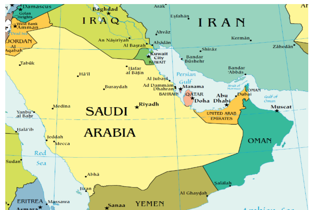
Middle East map, by University of Texas at Austin

The order is for two wells in an offshore development; one oil producer and one water injector. The objective is to increase productivity and injectivity, respectively, in new wells in a tight limestone/dolomite formation.